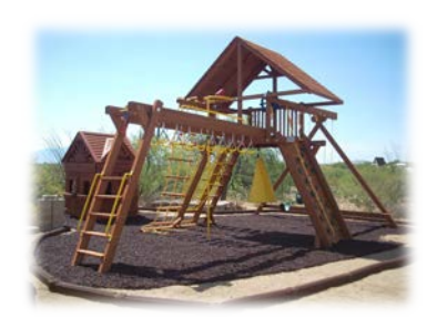
The new Pebble play area!